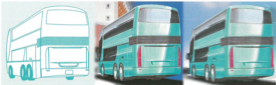
From design to quality in motion

The bus constructors of the future offer you security all the way. From CAD-station to delivery, from financing and insurance to after sales services and maintenance contract. From A to Z.