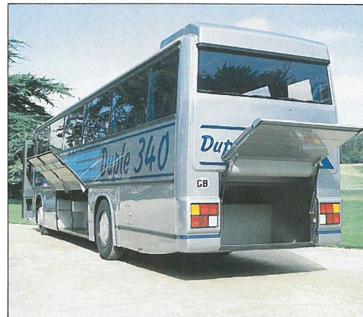
Maximised luggage capacity on all chassis types