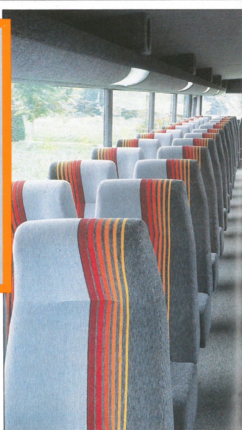
Luxurious, soft safety trimmed interior visibility for up to 61 passengers

The 300 series bodies are based on an extremely rigid jig built frame with stressed metal side panels. The whole assembly is thoroughly corrosion proofed offering long life and high re-sale value.