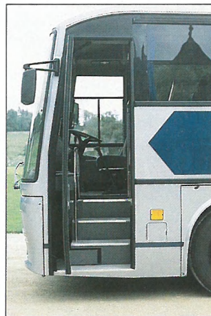
Wide entry with low step heights