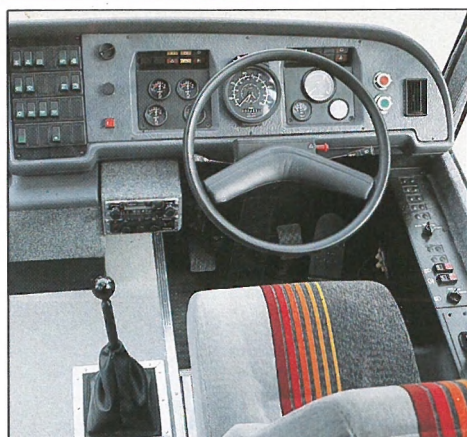
Superbly comfortable driver environment