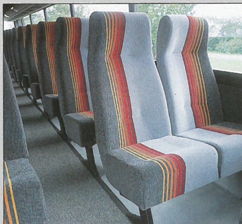
Individual bucket seats have exceeded a 15G crash standard