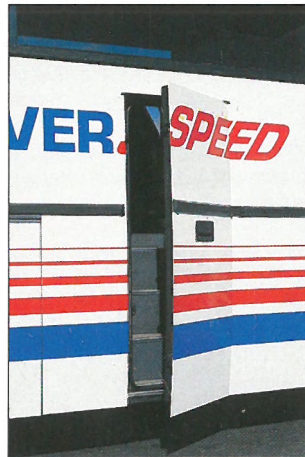
Optional Continental door and toilet