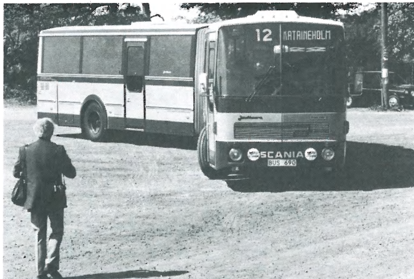
● According to Scania, rigid rear axles on the new artic pusher bus minimise the risk of jack-knifing even with a retarder.

for practically all types of service. This means that they must meet a wide range of specifications. Low floors are required for buses in urban traffic whereas raised floors with all the seats facing forward and large underfloor baggage compartment may be specified for vehicles used in unscheduled traffic. With gross weights of 25 tonnes and over, drive line components capable of meeting the requirements of good acceleration and high speed must be readily available. Buses with adequate sound insulation must be available for applications where there are stringent noise emission regulations.