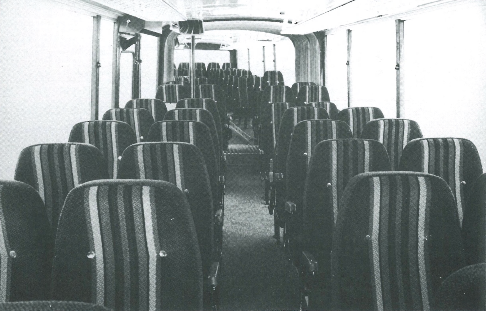
● Left: The new Scania articulated pusher bus with rigid middle and rear axles as seen from the front. Right: The interior of the bus showing the comfortable, fabric-upholstered semi-tourist seats which, like the body, bear the unmistakable Jonckheere stamp.

signed by the German firm of Robert Schenk GmbH . A total weight distribution of 6 tonnes on the front axle at approx. 10 tonnes on each of the other two axles is achieved by locating tanks and other accessories at the articulated joint.