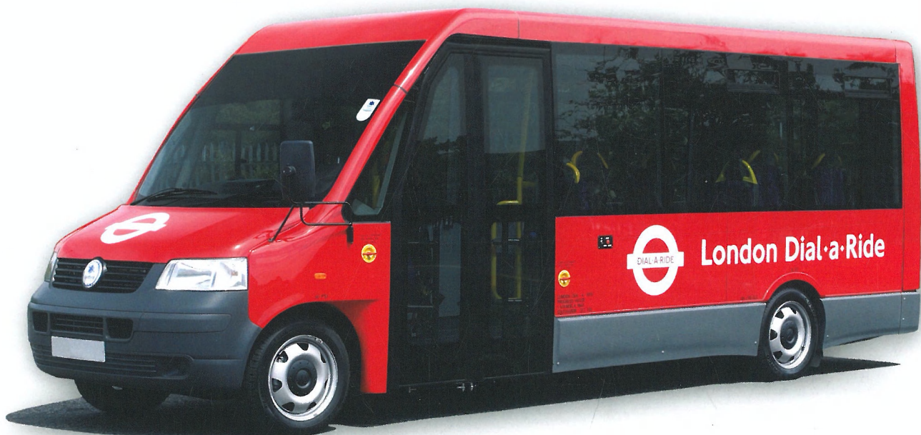
Flexible Seating Layouts