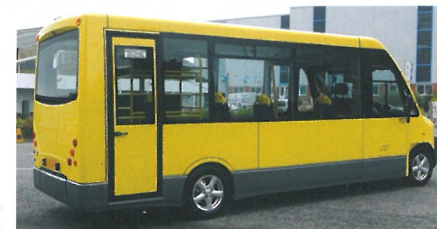
Coach back body style with emergency exit